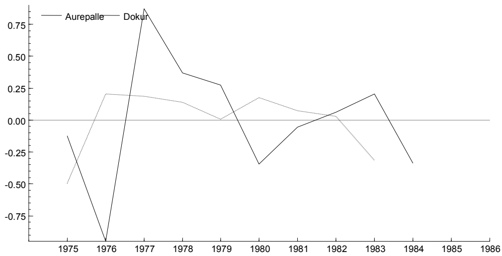
Figure 1 Crop shock in Aurepalle and Dokur in Andhra Pradesh

Note: Crop shock is averaged for each village.