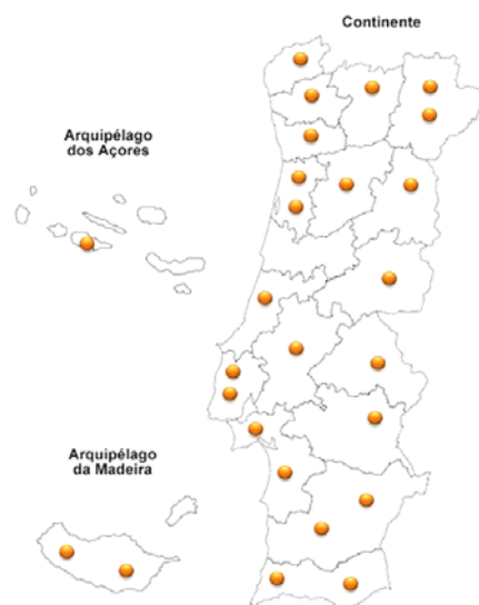
Figure 1 - Geographical distribution of the selected sample

Table 2 summarises the main characteristics of the municipalities included in the sample for the year 2008. In some of the municipalities a very high proportion of land area is subject to ecological constraints, such as Barrancos or Campo Maior, 99.9% of whose territory is under conservation status.