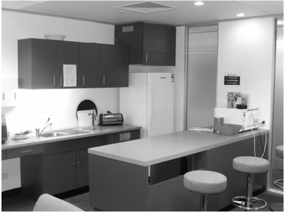
Figure 1: Order condition