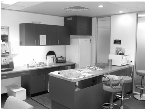
Figure 2: Disorder Condition