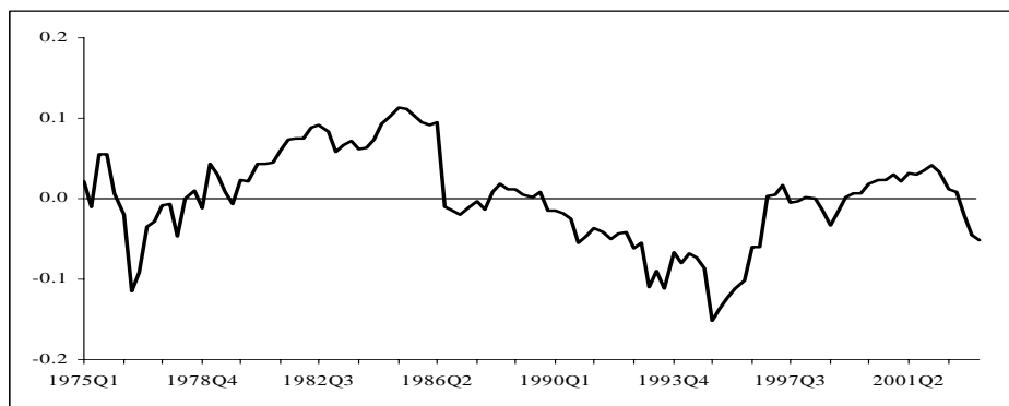
Figure 2: IRELAND/GERMANY: actual minus fitted.