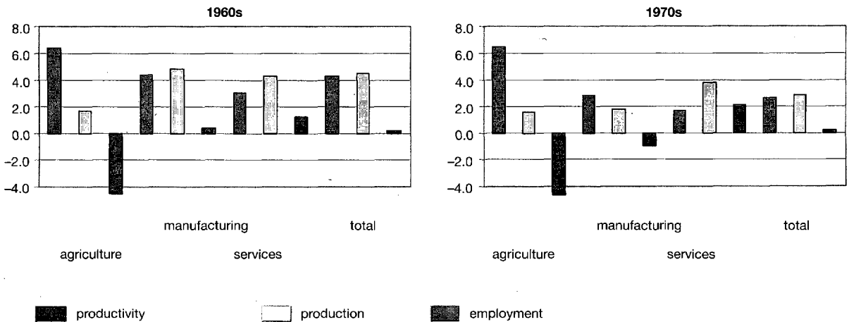
Figure 3 Growth Rates of Productivity, Production and Employment by Industry (annual averages)

Individual countries or regions can improve demand for their products by exporting but this is not a viable strategy for all countries simultaneously.