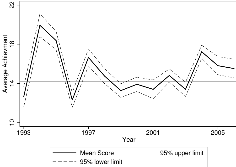
Figure 2: Country level Dynamics in the Average Performance at the IMO

answer these questions we use equation (3) and regress the average performance on a set of year dummies, with 2000 as reference year, conditional on the unobserved country effects. Fitted values from the regression are plotted in Figure 2.