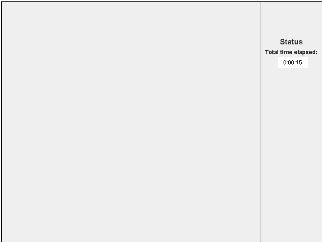
Figure A.2: Empty screen