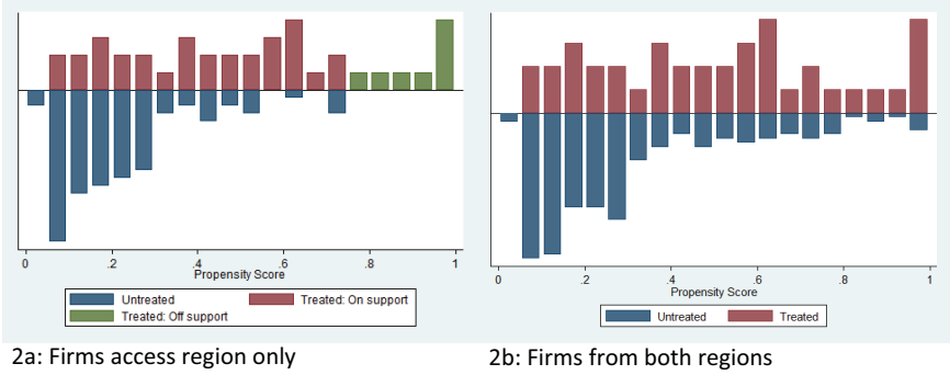
Figure 2: Propensity score distribution and common support for propensity score estimation

We apply both nearest neighbor and kernel matching. The former is conducted without replacement, the latter with replacement. The results are presented in Table 7. The unmatched treatment effect in the access-region only case shows that the difference in firm profits shrinks once the electricity reliant firms are pruned from the sample. The difference is positive, but now insignificant. It comes as a surprise that the matched treatment effect using firms from the access region only is higher than the simple unmatched difference in means. Parts of this increase is induced by the elimination of firms exhibiting high propensity scores off the support (see Figure 2a). The matched difference is even higher if kernel matching is applied. In both cases, though, the treatment effect is not significantly different from zero.