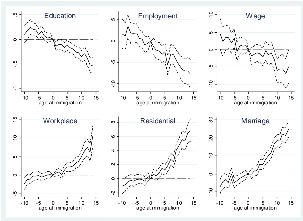
Figure B 1 Semi-parametric OLS-estimates

Notes: Results corresponding to those presented in Figure 1, but estimated using the alternative approach described in section 5.