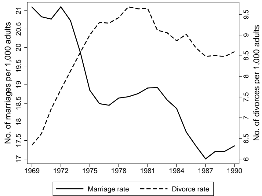
Figure 1: Marriage and Divorce Rate, United States 1969–1990.