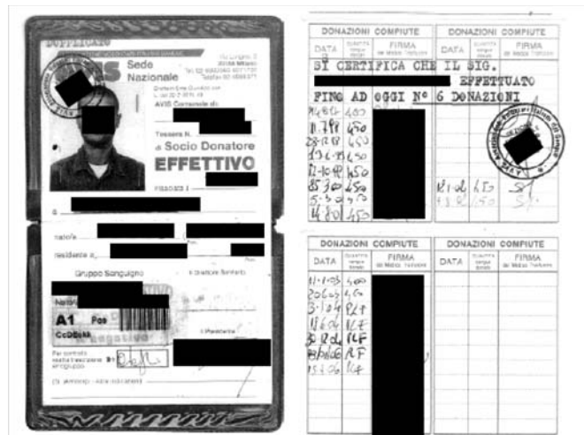
Figure 2: Sample AVIS membership card. The donor's personal information and any possible identifying detail have been redacted for confidentiality reasons.