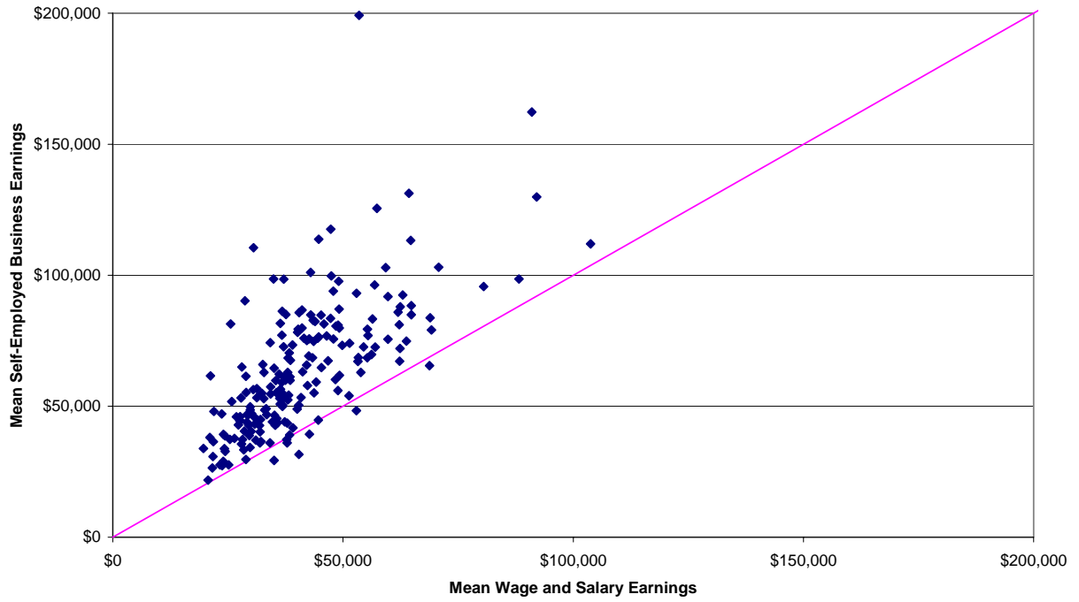
Figure 1 Mean Self-Employed Business Earnings vs Mean Wage and Salary Earnings by Industry - Men Census 2000