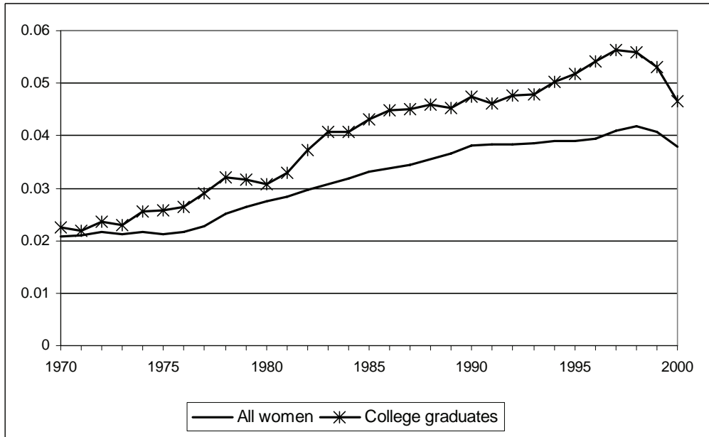
Figure 2: Joint Rate of Child-Bearing and Employment

Data Source: March Current Population Surveys, 1969-2001 (King et al. 2004).