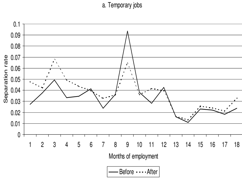
Figure 1: Monthly separation rates by employment duration; males