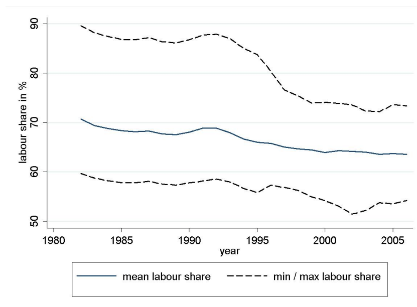
Figure 1: The average labour share in a sample of OECD countries

Figure 1 clearly shows the source of concern: For a sample of OECD countries, the labour share has on average declined by roughly seven percentage points since 1980. For individual countries the picture is similar. All countries in the sample individually report a decline except for the United States where the labour share has nearly remained constant. 2