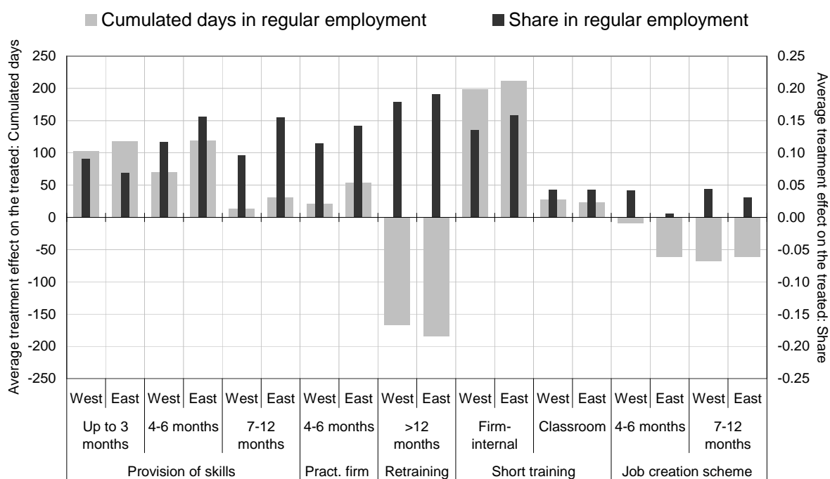
Figure 1 Average treatment effects of participation in selected programmes compared to waiting

Note: Outcome variables are measured 3.5 years after programme entry in March 2003.