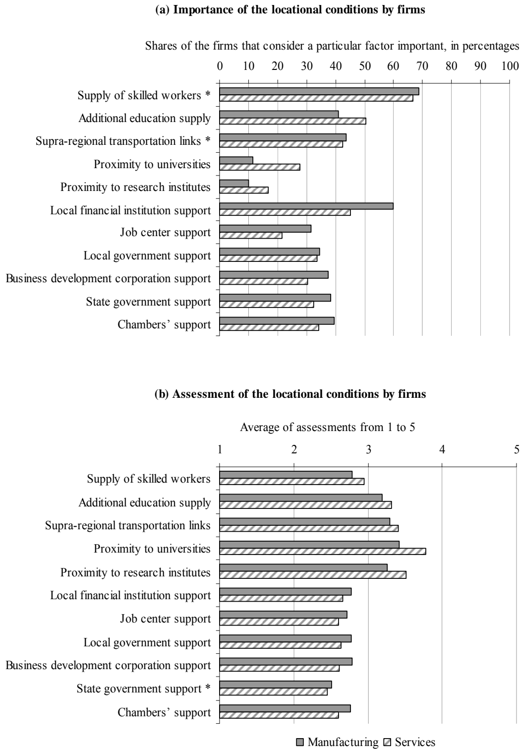
Figure 2 Importance and assessment of locational conditions by firms

NOTE: * denotes insignificant mean differences at 5 percent level.