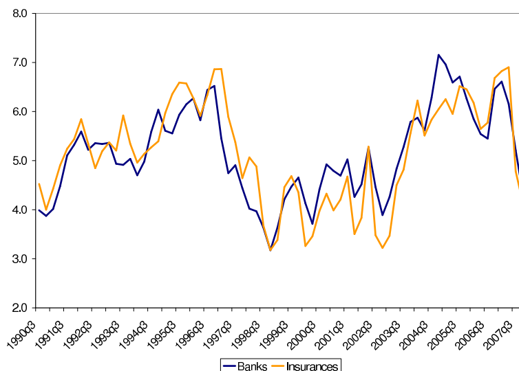
Figure 1: Average DD by Sector over Time

Explanatory variables The aim is to predict DD from a macroeconomic perspective. Firm specific variables frequently used in the literature on firm default are mostly based on balance-sheet variables and market-driven variables (Zmijewski 1984, Altman 1993, Shumway 2001, Carling, Lindé and Roszbach 2007). These variables are accounted for in the construction of DD in a model based approach, and it is therefore not necessary to include them as regressors in our model. Furthermore, recent research, such as Carling et al. (2007), indicates that macroeconomic variables have significant explanatory power for firm default risk and that taking macroeconomic conditions into account allows to pin down the absolute level of default risk, while firm-specific information can only make reasonable accurate ranking of firms' according to default risk.