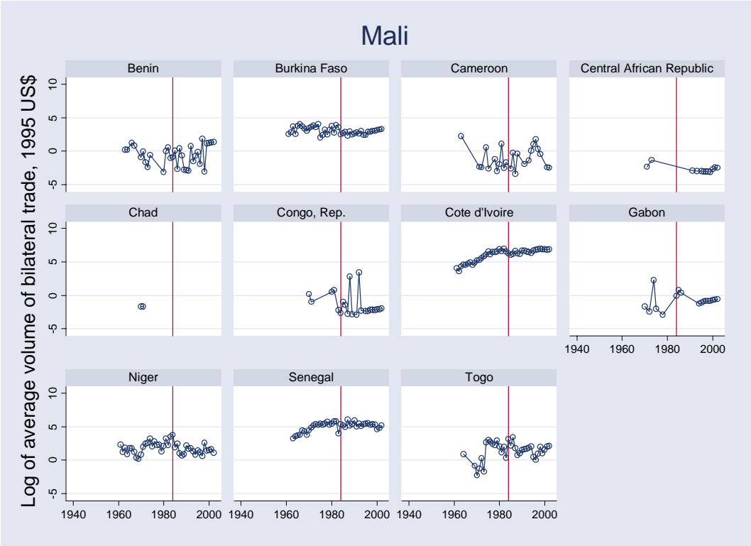
Figure 1: The Evolution of Trade for CFA Franc Zone Entering Countries