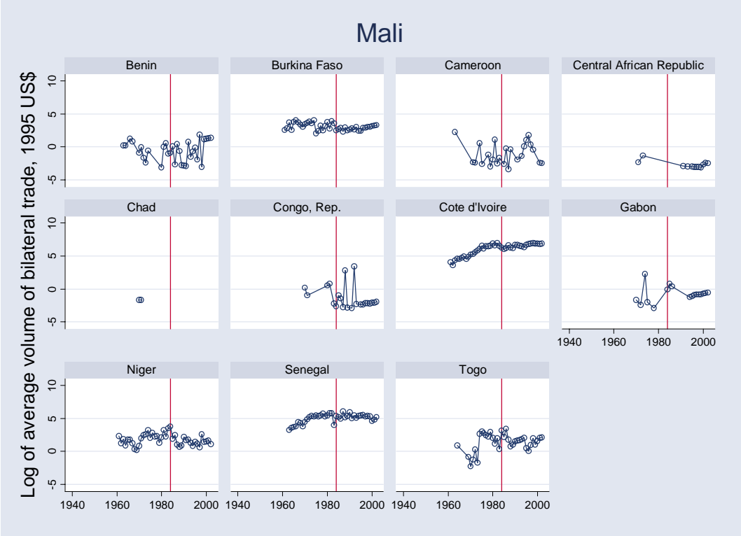
Figure 1: The Evolution of Trade for CFA Franc Zone Entering Countries