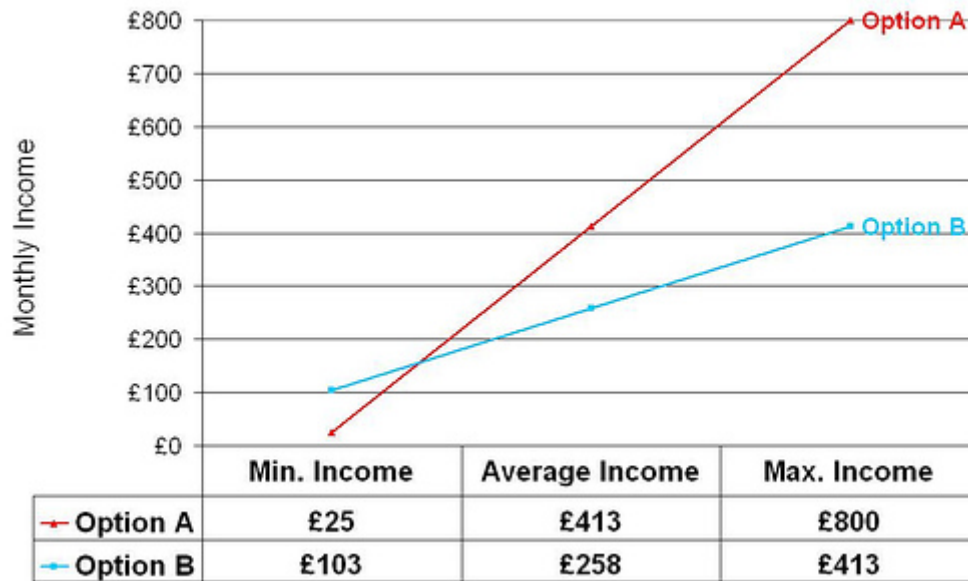
Figure 2. Graphic illustration of income distributions.

Under the assumptions of the standard model, this information can be used to estimate the coefficient of relative inequality aversion. The mathematical structure is based on Carlsson et al. (2005) and Johansson-Stenman et al. (2002), but the question-framing is different.