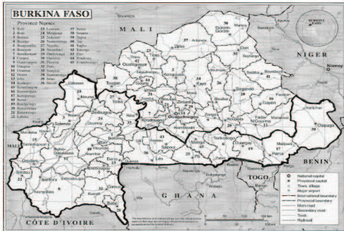
Figure 3 Provinces included in empirical analysis