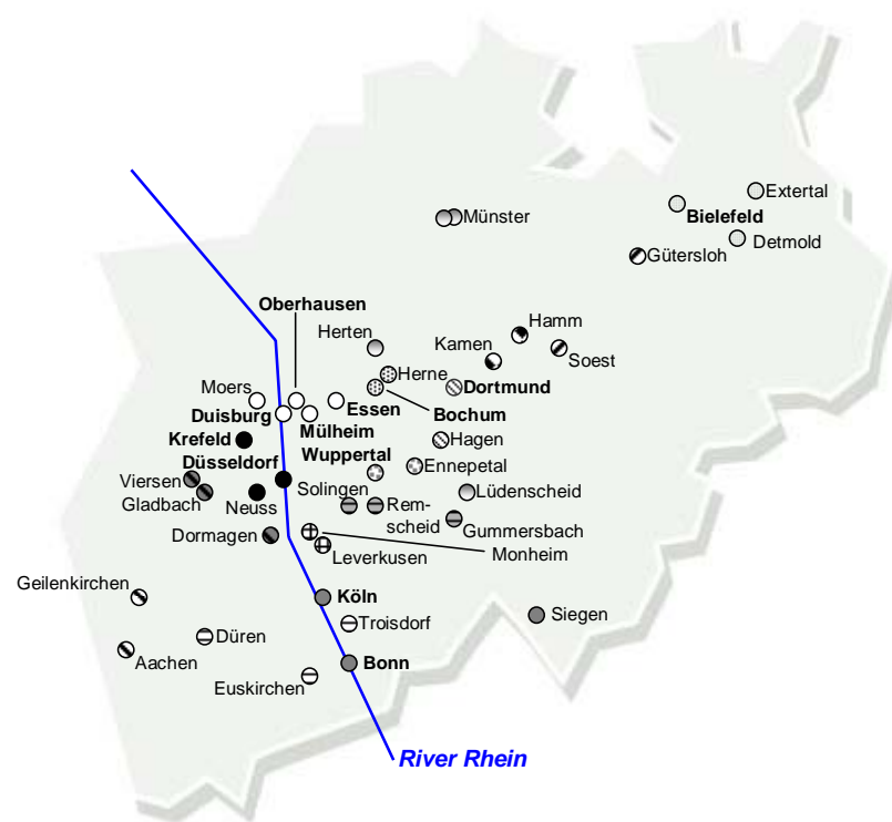
Figure 1: Geography of local public transport mergers in North Rhine-Westphalia

Legend: Tram or light railway operators in bold font Different shadings relate to the mergers ○ Not merged companies