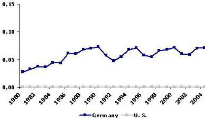
Table 1: Primary Energy Supply Mix in % in Germany and the U. S.