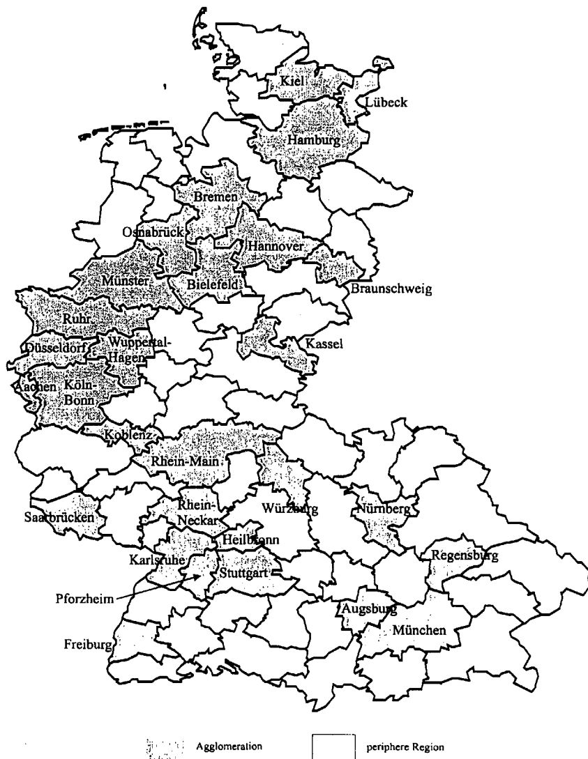
Figure 1 — Regional structure of West-Germany, 75 regions

happens most often when the number of neighboring regions is not restricted to a (region-specific) sub-sample of all regions under investigation. From test calculations as those plotted in