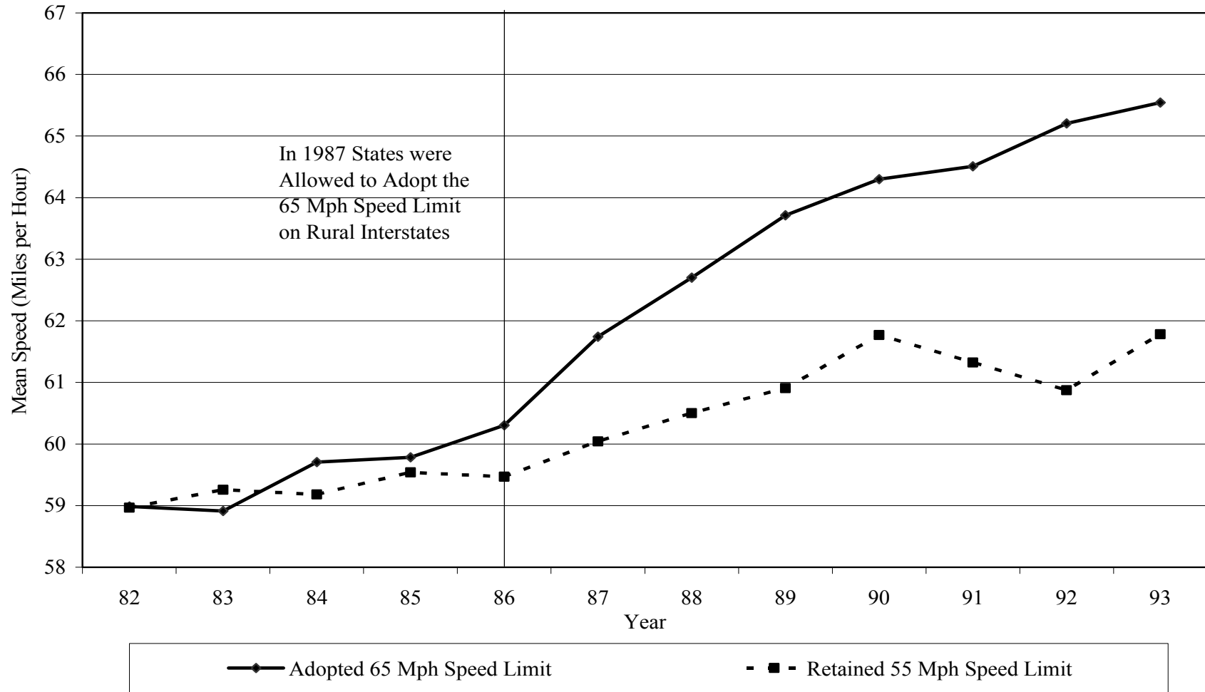
Figure 4: Trends in Mean Speeds on Rural Interstate Roads, by Adoption of 65 Mph Speed Limit, 1982-93

Notes: Mean speed is calculated as the weighted mean, where the weight is vehicle miles of travel.