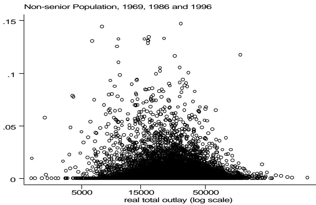
Figure 1: Out-of-Pocket Prescription Drug Expenditures