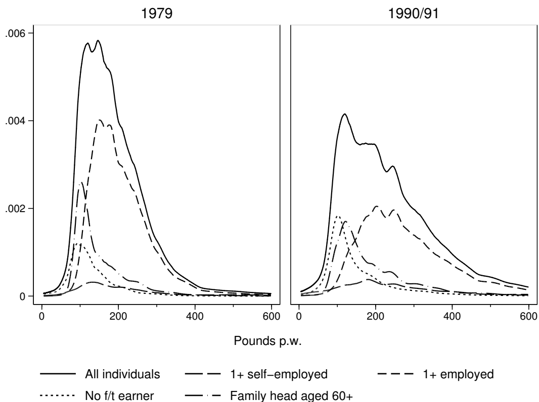
Figure 2: PDFs for 1979 and 1990/91

Note: Each subgroup PDF is weighted by the relevant subgroup population share.