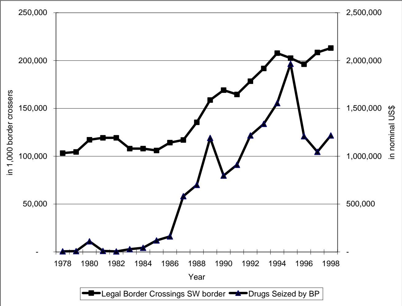
Figure 2: Legal Border Crossings and Drugs Seized by the Border Patrol