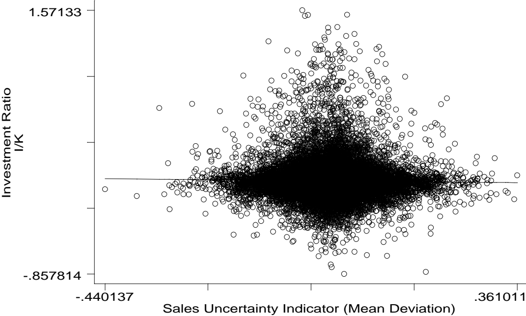
Graph 3: Added Variable Plot for Sales Uncertainty

coef = -0.04573, robust se = 0.01723, t = -2.654