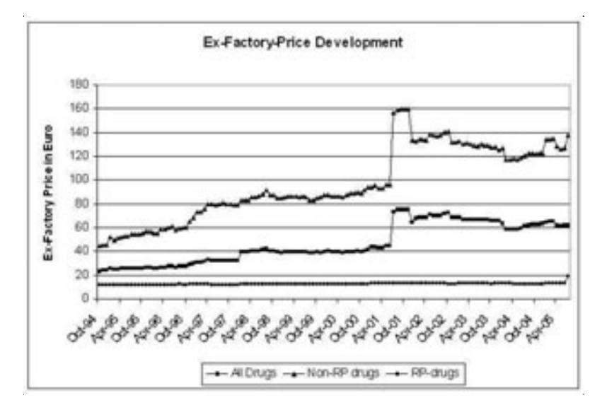
Figure 1: Ex-Factory-Price Development

In our empirical analysis the dependent variable is the ex-factory price p_{it} of drug i in month t. The development of ex-factory prices of all drugs included in the regression analysis is presented in figure 1. The (unweighed) average nominal price of the non-RP drugs increased during the period of observation, whereas the average price of the RP-drugs remained almost constant.