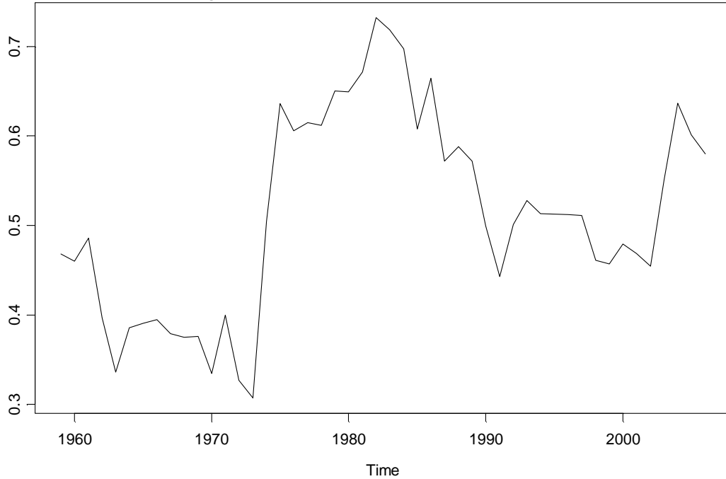
Figure 3 The temporal evolution of the degree of information content in the maximum eigenvalue of the empirical correlation matrix formed from the time series of annual real GDP growth for the main world economies of the US, UK,, Germany, France, Italy and Japan, 12 year windows, 1948-2006

Over the 1948-1959 period, for example, the first observation in the chart, the ‘market’ eigenvalue took up just under 50 per cent of the total of the eigenvalues, indicating a reasonable but not dramatic degree of convergence of their business cycles. But then, advancing year by year there is a distinct trend fall, until over the 1962-1973 period, a minimum is reached where the maximum eigenvalue is only 30 per cent of the total.