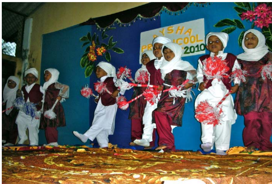
Figure 4: A pre-school performance with children wearing what is locally referred to as the Pakistani jubba , Kantale, Trincomalee.