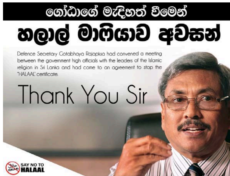
Figure 5: A Sinhala-language BBS propaganda poster/flyer portraying a seemingly partisan Defence Secretary, alongside its anti-halal campaign logo.