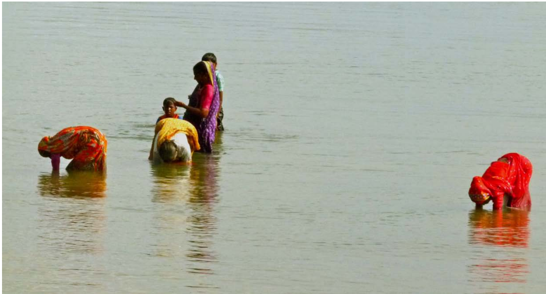
Figure 2: Lagoon shell-gleaners working in the makkadu -sari, Kinniya, Trincomalee.