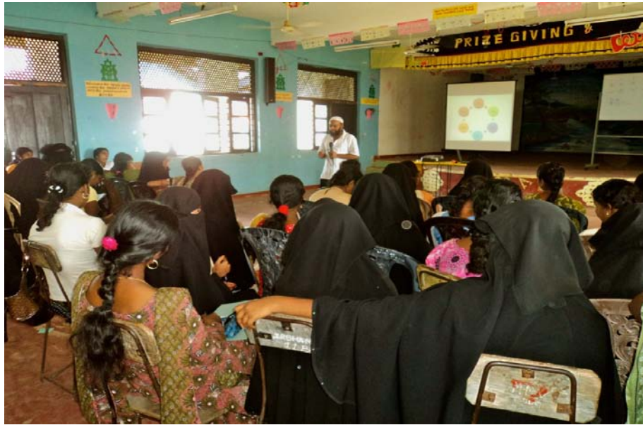
Figure 3: Caregivers attending a school-based workshop on interfaith relations, Kantale, Trincomalee.