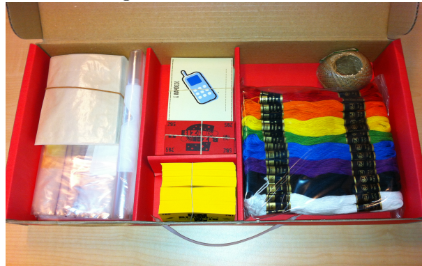
Figure 1: Course material

Schools sign up for the program at the beginning of each school year (before January). The children participating in the program are aged 11 or 12 and are in the last grade of primary school. Most schools have either one or two (parallel) classes in last grade. In general, the decision to participate is taken at the school level. The minimum level of participation is an entire class, i.e., individual pupils or teams cannot participate. The five-day program usually takes place within a period of 2 to 4 weeks during the last few months before the pupils go to high school. It is a structured program and a day-by-day overview of the content is shown in Table 1.