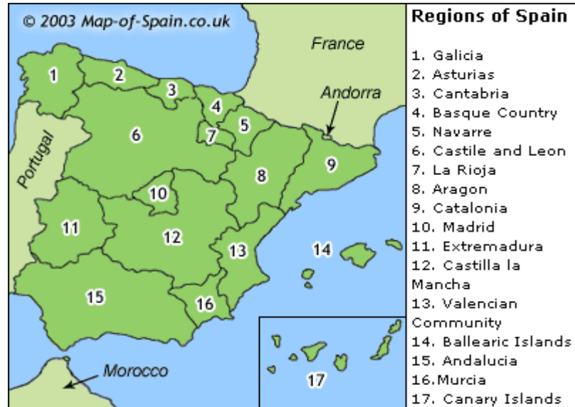
Figure 1: Regions of Spain

NOTE: Kindly and freely available from http://www.map-of-spain.co.uk/