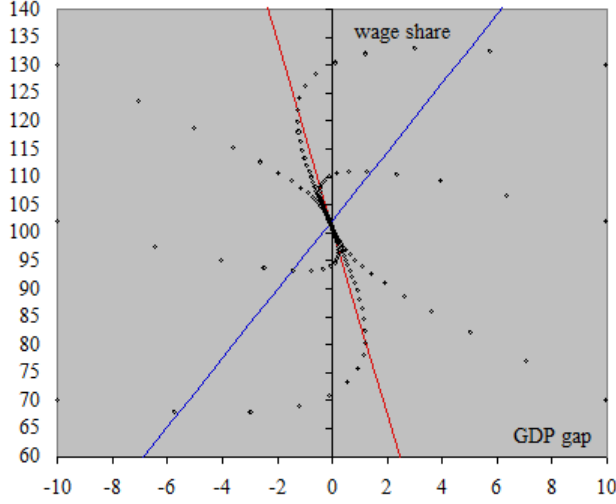
Figure 3: Estimated response paths

labor market institutions or the degree of taxation. Probably offshoring is one of the aspects of globalization that disadvantages workers. No doubt wage outcomes are also influenced by countervailing union power, and no doubt union density has a political dimension that is institutionalized into the generosity of the social safety net.