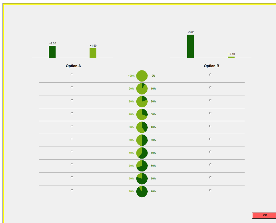
Figure 1: Risk elicitation task

We modify the MPL format, by making the components of the decision problems as visual as possible. Figure 1 shows the screenshot of the risk task.