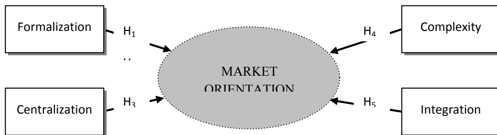
Figure 1. Conceptual model