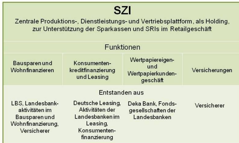
Chart 3: Functions and components of the SZI

Therefore, it is necessary, among other things, to adjust the ownership structures at DekaBank and transfer DekaBank to the sole ownership of the savings banks. DekaBank and other banks of the S-Finanzgruppe [savings banks financial group] that are owned by the savings banks may represent the nucleus of the Sparkassenzentralinstitut [national financial service institution].