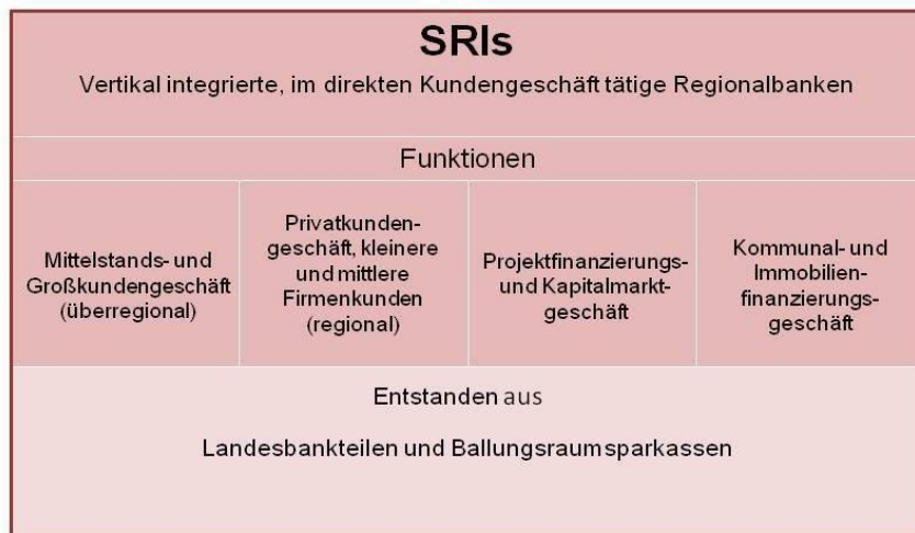
Chart 2: Functions and components of SRIs

The creation of integrated business models leads to competitive units for the private and corporate client business that are able to hold their own in intra-European competition with access to the capital market. Several such regional clusters should be created in order to fulfil the second basic requirement, namely competition. These could constitute an effective competitive corrective to the private commercial banking sector.