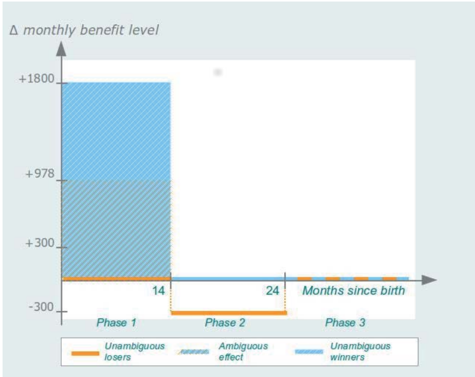
Figure 1: Changes in the Benefit Structure

During Phase 1, the blue shaded area indicates the “unambiguous winners” of the reform, i.e. these are mothers that receive the new and generous benefit but would not have received any benefit under the old, means-tested regulation. This is indicated by the “+978” on the y-axis, which is the benefit payment that corresponds to the maximum income at the cut-off of the means-test. That is, the households below this line (grey shaded area) would have received a transfer also under the old regime. The exact delta for them is ambiguous, however, as it depends on the precise benefit level and duration they would have received previously. Finally, there is a set of households that are “unambiguous losers” of the reform: these are those (low-income) households that after the reform receive the minimum monthly transfer of 300 € for 14 months, but would have received 300 € for 24 months under the