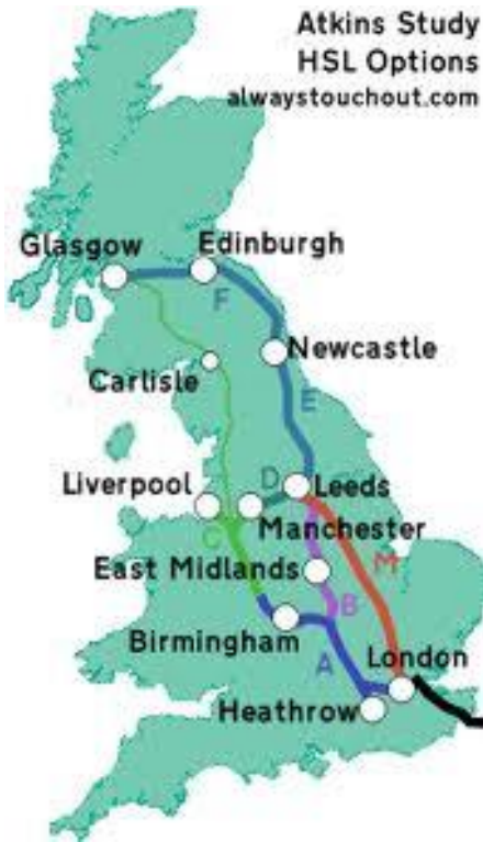
Figure 4.1 Options considered by the Atkins study for HSR