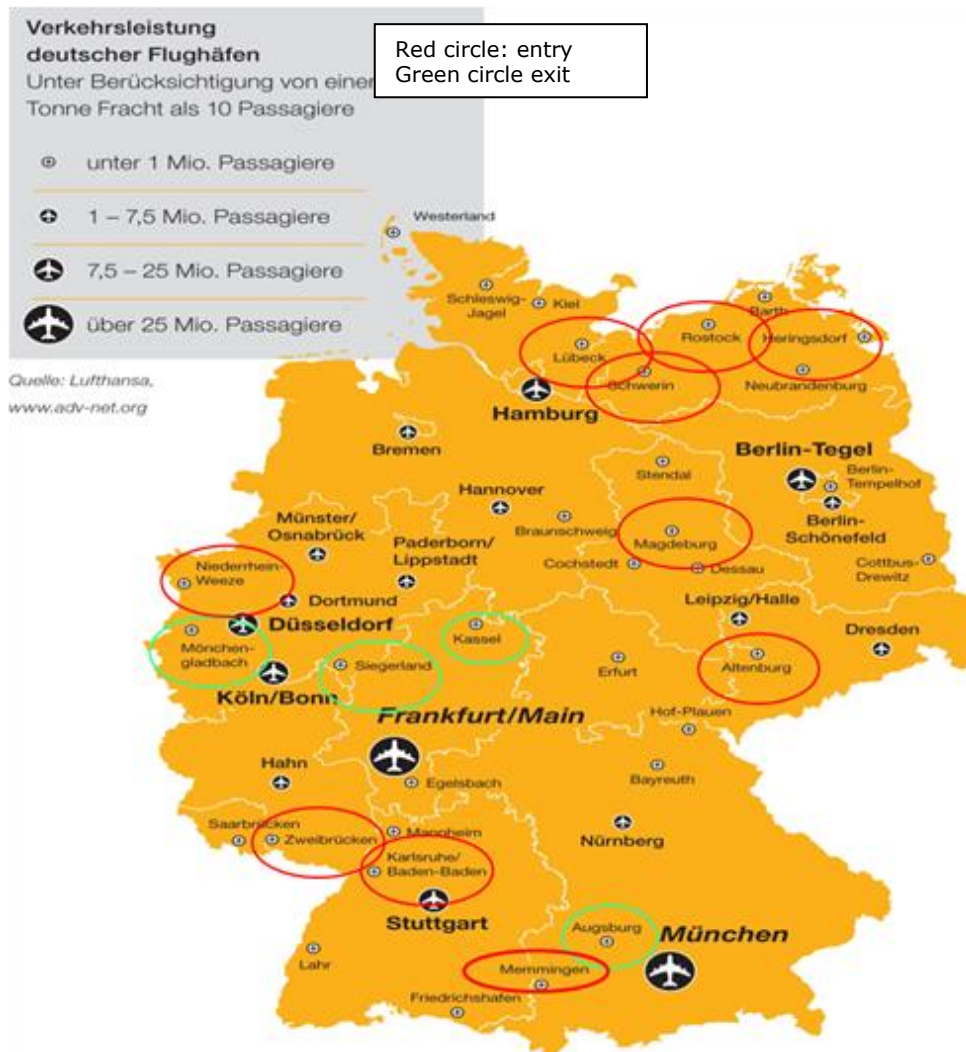
Figure 2. Market entry and exit of German airport from 1995 to 2012

argue that the airport should not have been built in the first place and operations will only be feasible if subsidized. Building the airport is supposed to have cost 271 Mio € which is actually 40 per cent more than planned. The project is financially supported by EU funds and from the federal state of Hessen. The management plans to break even in 2018 (Schmidt, 2011; Bamberg, 2013). The extent and degree to which smaller German airports are subsidized is not clear, but remains an issue 2 in particular as the EU Commission has begun to investigate in whether the city of Lübeck has subsidized Infratil, Ryanair, Wizz Air and other airlines (EU COM, 2012).