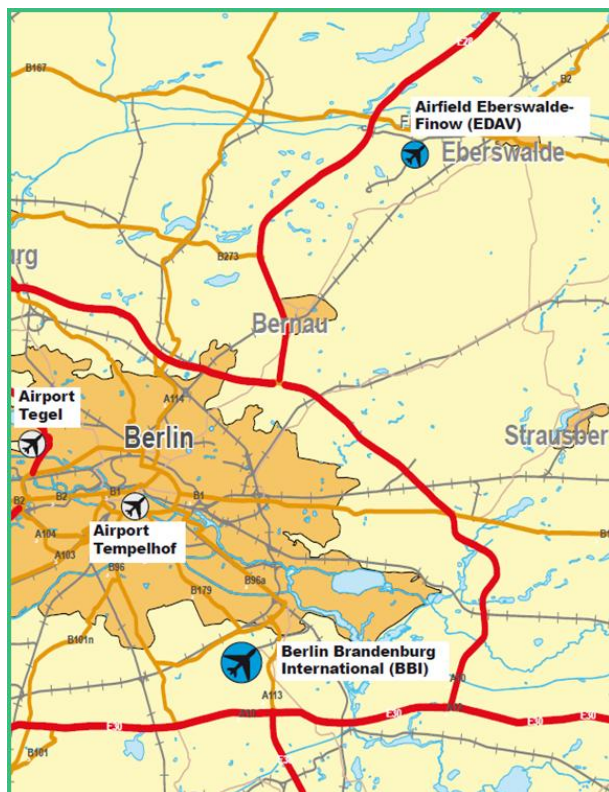
Figure 4. Map of Berlin Airports

Eberswalde-Finnow airport is an airport 55 km south east of Berlin (see Fig 4). It has a runway of 2520 meter length and could technically serve flights of Boeing 737-800. However it is permitted only for flights with a maximum take-off weight of 14 tons. The EU funded project has studied the “potential future role of Eberswalde-Finow airfield/airport against background of upcoming structural changes” (Levsen, 2007, slide, 2) and concluded that the airport “will be the only suitable airport location for the business model of True Low Cost Carriers (TLCs) in Berlin and Brandenburg in 2011” (ibid. slide, 4).