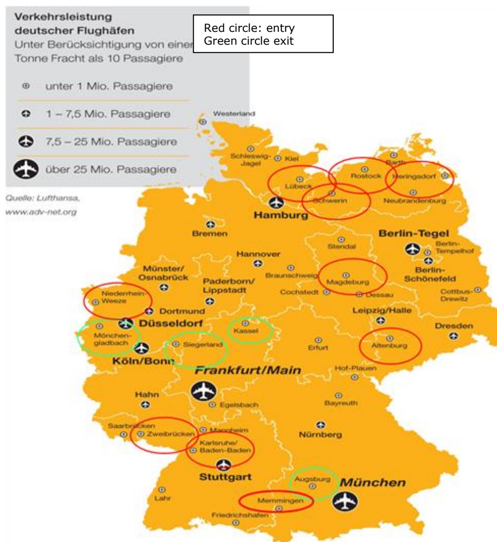
Figure 2. Market entry and exit of German airport from 1995 to 2012

argue that the airport should not have been built in the first place and operations will only be feasible if subsidized. Building the airport is supposed to have cost 271 Mio € which is actually 40 per cent more than planned. The project is financially supported by EU funds and from the federal state of Hessen. The management plans to break even in 2018 (Schmidt, 2011; Bamberg, 2013). The extent and degree to which smaller German airports are subsidized is not clear, but remains an issue 2 in particular as the EU Commission has begun to investigate in whether the city of Lübeck has subsidized Infratil, Ryanair, Wizz Air and other airlines (EU COM, 2012).