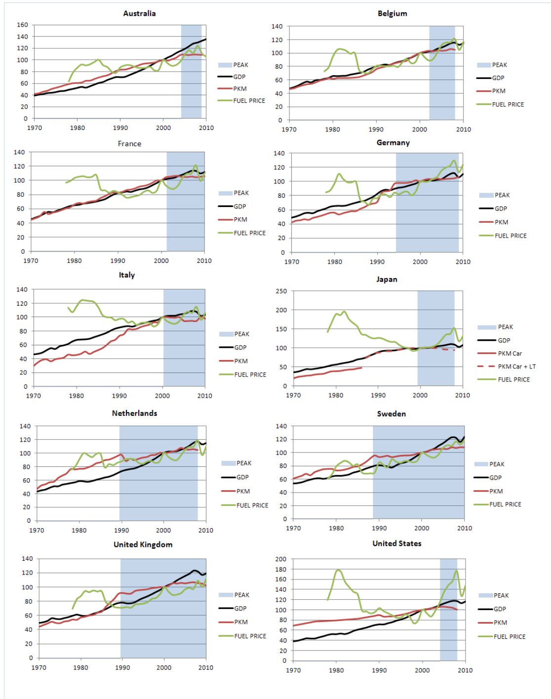
Figure 2. Index of GDP, fuel price and Passenger-kilometres (PKM) in 10 high-income economies, 1970-2010 (base year 2000)

Source: Passenger-kilometres are private car travel taken from ITF Statistics, USA data interpolated for missing data points before 1990, Japan data are without light trucks (full) and with light trucks (dotted); fuel price index is a volume-weighted average of gasoline and diesel prices taken from IEA Energy Prices and Taxes and volumes taken from the IEA MoMo database, for Japan only a gasoline price index is used; GDP data is from OECD National Accounts and in constant 2005 PPP USD; shaded area denotes period when a structural change in private car travel is assumed in the regressions discussed in Box 1.