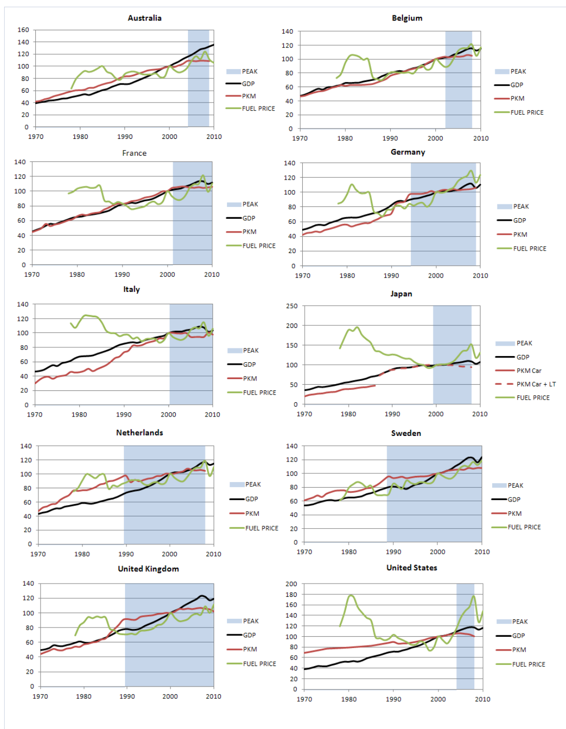
Figure 2. Index of GDP, fuel price and Passenger-kilometres (PKM) in 10 high-income economies, 1970-2010 (base year 2000)

Source: Passenger-kilometres are private car travel taken from ITF Statistics, USA data interpolated for missing data points before 1990, Japan data are without light trucks (full) and with light trucks (dotted); fuel price index is a volume-weighted average of gasoline and diesel prices taken from IEA Energy Prices and Taxes and volumes taken from the IEA MoMo database, for Japan only a gasoline price index is used; GDP data is from OECD National Accounts and in constant 2005 PPP USD; shaded area denotes period when a structural change in private car travel is assumed in the regressions discussed in Box 1.