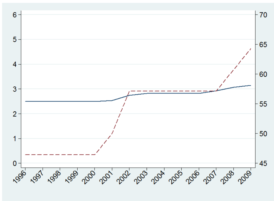
Figure 2: Transfer-Pricing Regulations among OECD countries

Solid line: Mean level of strictness of transfer-pricing regulations imposed among OECD countries measured on the left axis. Dashed-line: Share of countries with strict regulations in % measured on the right axis.