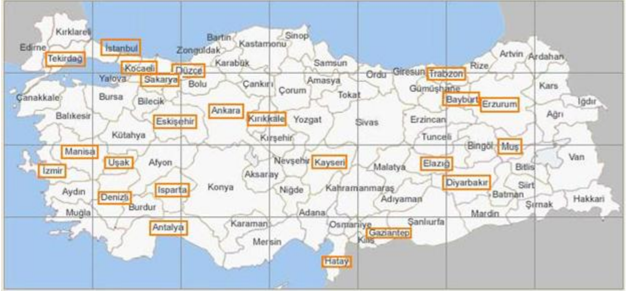
Figure 1: Geographic Distribution of Provinces

Provinces selected for experiment are indicated by orange rectangles around their names.