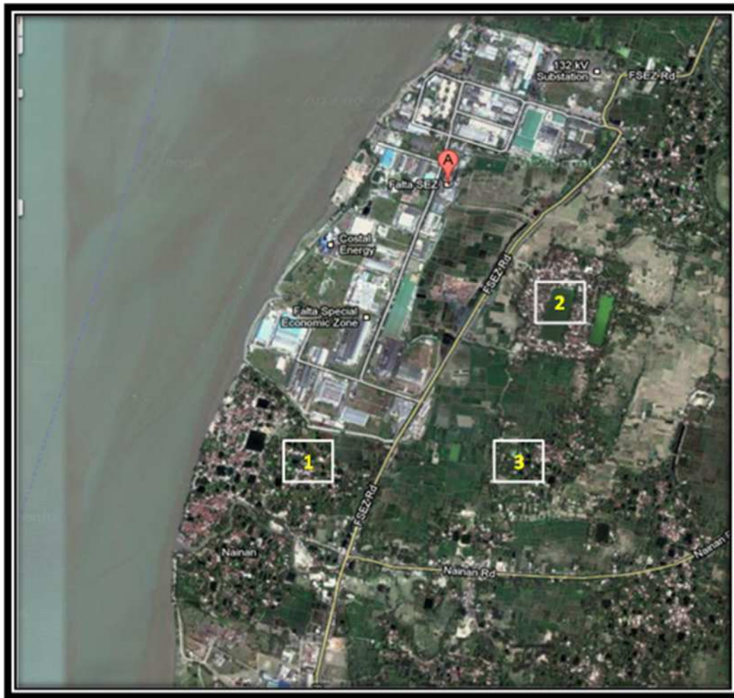
Figure 2.1: The villages studied in this paper.

Note: 1 – Nainan, 2 – New Gopalpur (“Higland”), 3 – Gopalpur.