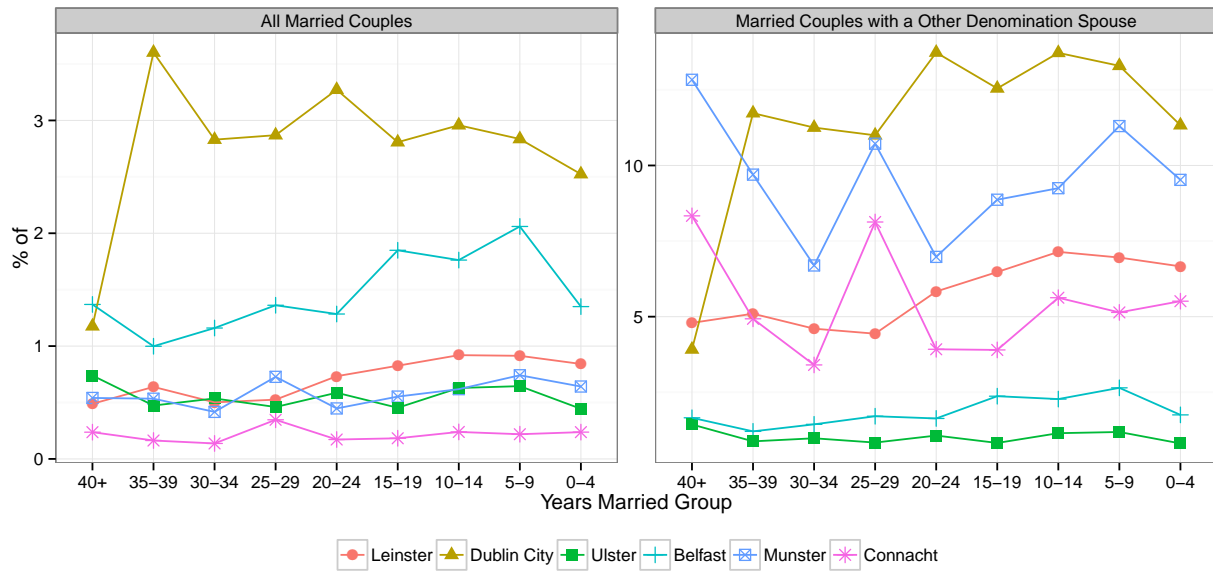
Figure 1: Inter-marriages by Year of Marriage Cohort