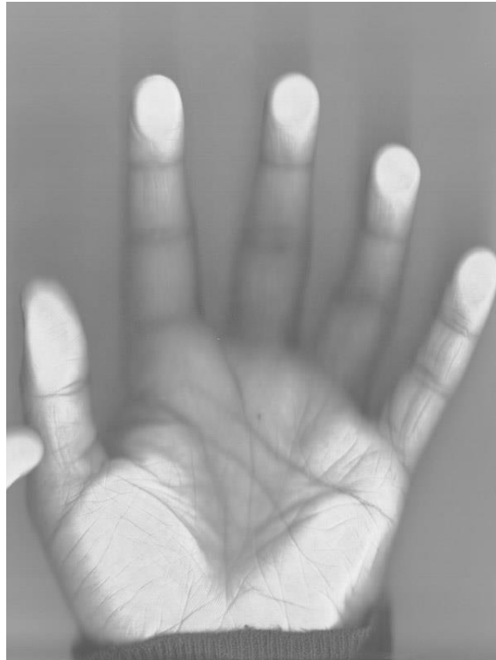
Figure 2: An incorrect scan: Lines are not visible.

Direct measurement with a digital caliper does not give you the option to re-measure and it is more difficult to make an accurate measurement if the hand is not on a 2D surface as in the images.