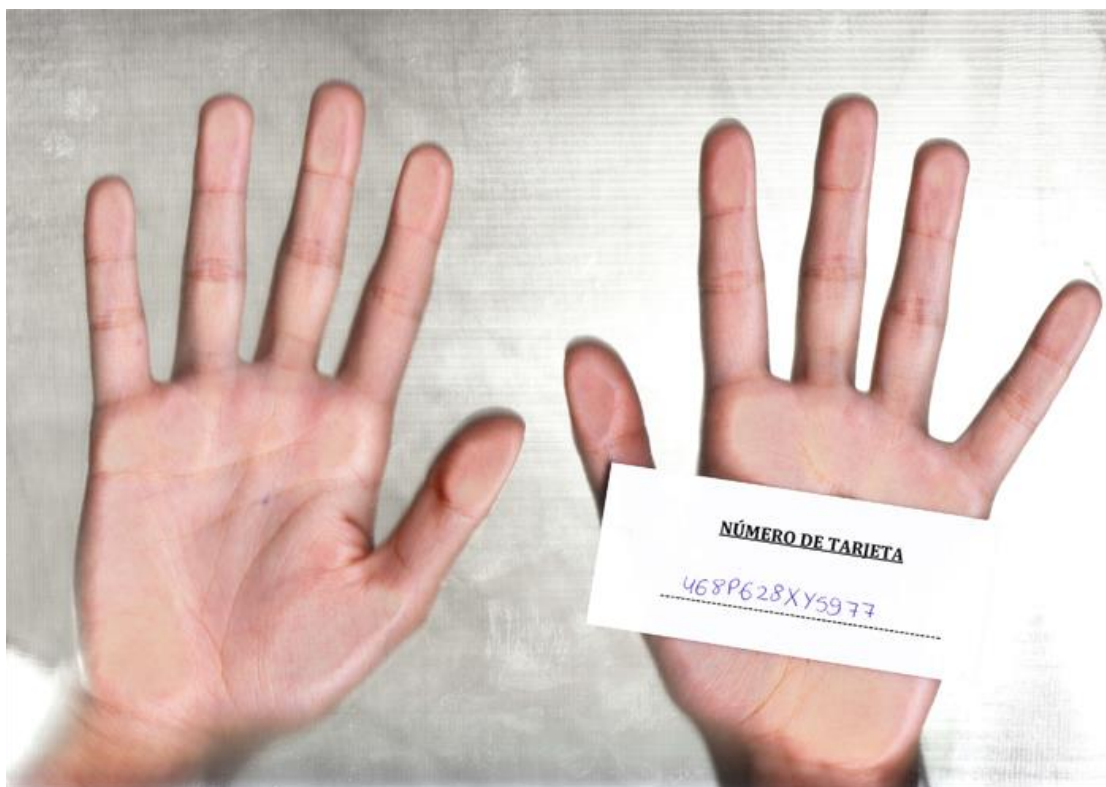
Figure 4: Correct Scan