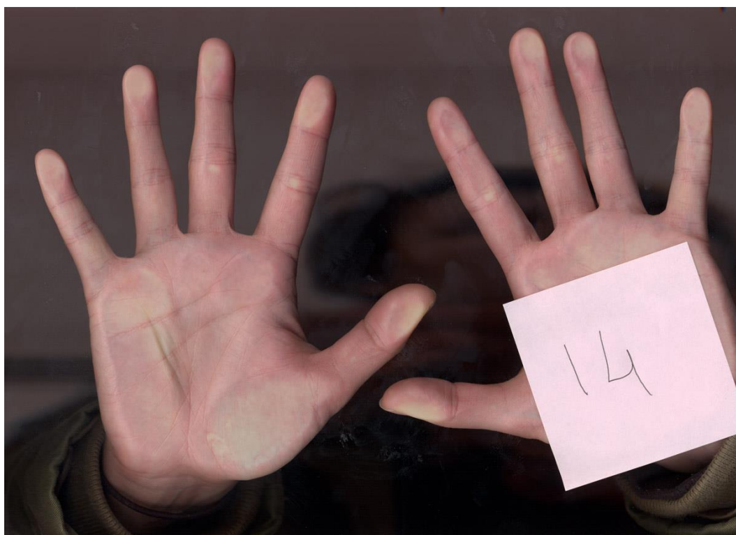
Figure 5: Correct Scan