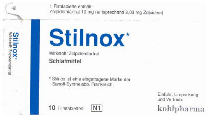
Figure 1: Figure of the imported drug package of Stilnox produced by Sanofi-Synthelabo and marketed by kohlpharma .