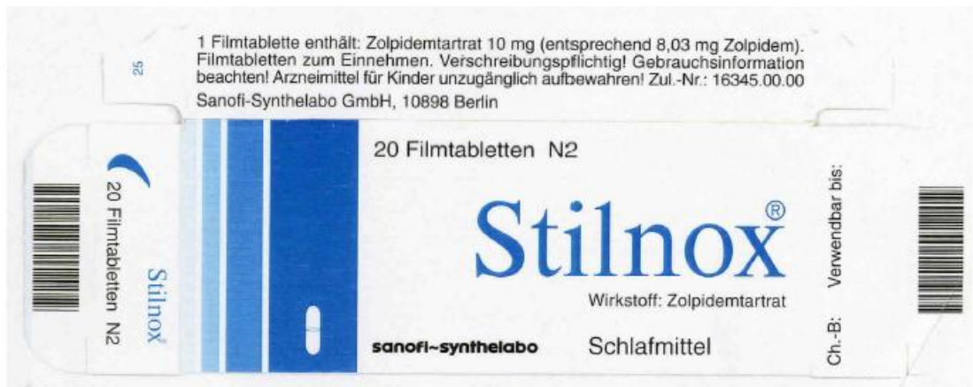
Figure 2: Figure of the original drug package of Stilnox produced by Sanofi-Synthelabo .