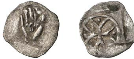
Picture 7. Handheller, Eastern Swabia, probably Augsburg (14 th century). Hand with small D )(Cross with small pellet in each cross end, 0.47 g, Ø 16 mm.

There was neither time to re-mint all the circulating coins nor the capacity to monitor the increased volume of coins in circulation. Finally, another trend typifies the burgeoning prosperity of a society undergoing urbanization. The use of coins with higher denominations and without regional constraints, e.g. Schilling , Heller , Groschen , Goldgulden , Ducats , rapidly expanded. These coins often crowded out local coins and were used more and more in international trade. These factors of course all blended together and made it near impossible for abbeys and laymen to hold on to their local coin monopolies.