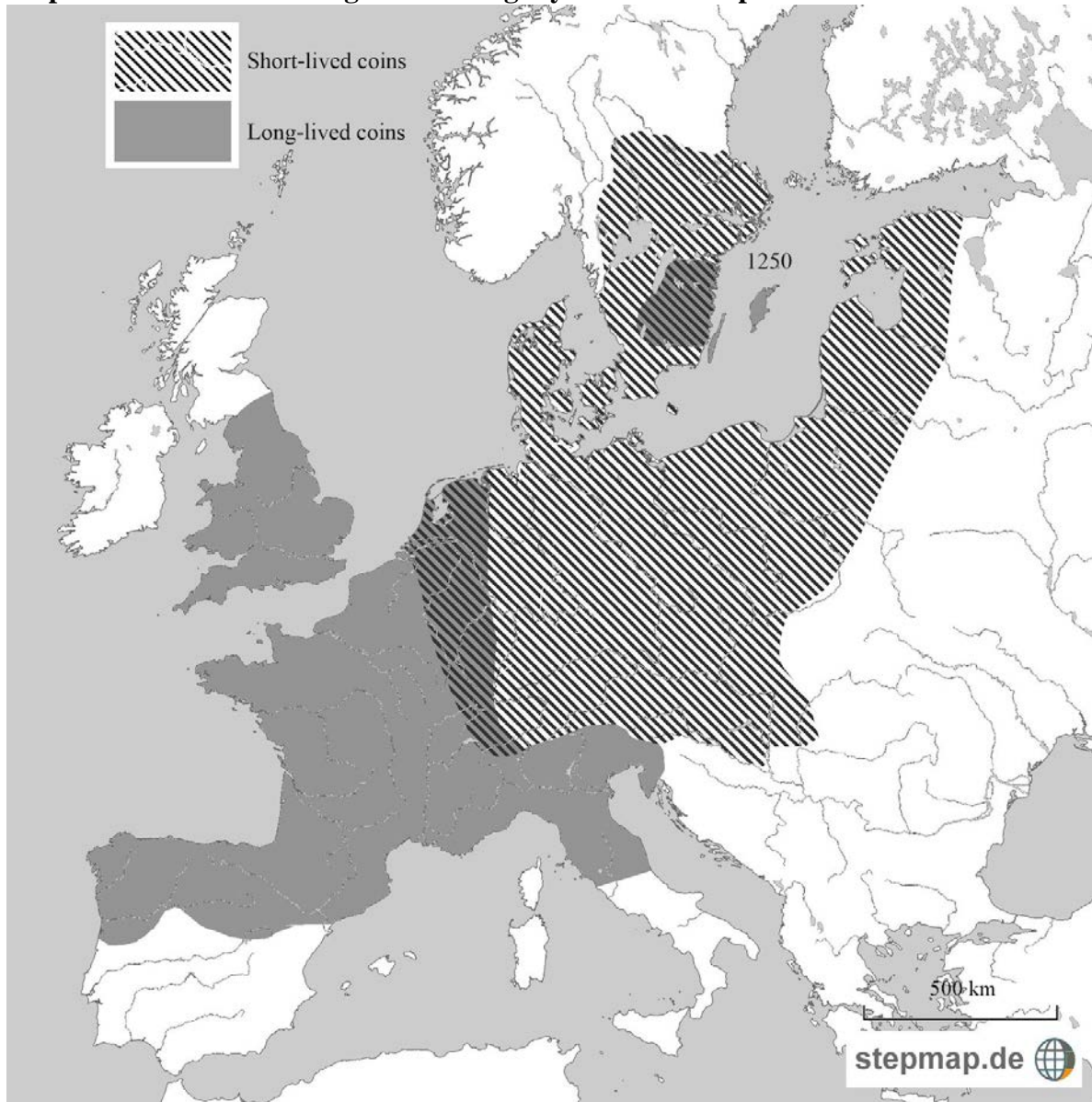
Map 1. Short-lived and long-lived coinage systems in Europe 1140–1300.

Note: Eastern Götaland, Sweden, changed from long-lived (Gotlandic) to short-lived (Swedish) coins in 1250.