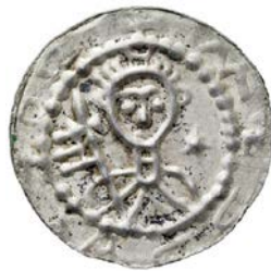
Picture 2. Bracteate, Pegau (Thuringia), Sheriff Wiprecht von Groitzsch (1091–1124), struck 1115/20. Bust of the sheriff with banner on lance, star in field, 0.72 g, Ø 21 mm.

The local population certainly had no difficulty in accepting the bracteates as medium of exchange; they had almost no experience of coins. It was more difficult to persuade local and foreign merchants to accept the bracteates. It was then necessary to introduce a geographical currency constraint, where the local bracteates were exclusively the currently sanctioned coins. Thereby, from the beginning the bracteates got a local limited circulation area (Kühn 1996:19). What must be stressed is that there is absolutely nothing in the historical record to indicate the first bracteates were short-lived coins. To the contrary, they seem to have circulated during relatively long time periods. However, the inherent fragility of the bracteates was thereby an endemic problem, forcing the issuer to substitute new for damaged bracteates from the same issue (Röblitz 1985:16, Kühn 1996:19). One of the earliest bracteates is shown on Picture 2.