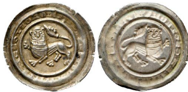
Picture 1. Obverse and reverse of a bracteate. Brunswick, Duke Henry the Lion (1142-92). Heraldic lion left, head facing, 0.71 g, Ø 27 mm. Legend: IEPNC.LEOELOVHHINRNCSOLEOA.

Bracteates are thin uni-faced silver coins that were struck with only one die. A piece of soft material, such as leather or lead, was placed under the thin flan (Kühn 2000:1ff). Consequently, the design of the obverse can be seen as a mirror image on the reverse of the bracteates (see Picture 1). A common misunderstanding is that all uni-faced coins are bracteates. 1 Uni-faced coins that have not been minted through the specific technology of using soft materials under the flan are not called bracteates. The diameter of the bracteates can vary from 10 to 50 mm and the weight is mostly between 0.05 and 1.00 g. The bracteates are only 0.05–0.20 mm thin. They are the most fragile coins in monetary history, but a high relief often stabilizes the coins.