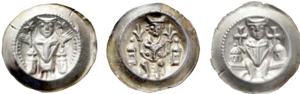
Pictures 3–5. Only the image changes at re-coinage. Three bracteates from the mint Hildesheim (Lower Saxony), Bishop Konrad II or successors (1240–60).

There may well also have been political motives for striking bracteates. Artistically designed coins were excellent marketing instruments for the coin issuer. The thin flan also proved practical, making it easy to cut the bracteates into halves ( Hälblinge ) or quarters ( Vierlinge ) when the need arose. Sometimes this was done at the mint (Dobras 2005:9). Halved bracteates are quite common in German coin hoards (Svensson 2013b:139, Table 13).