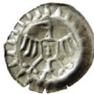
Picture 8. Salzwedel (Brandenburg), Margrave Joachim I (1499–1535). Eagle with head turned to the left, three feathers on each wing, shield on the breast, ray edge, 0.35 g, Ø 16 mm.

Even if re-coinage was abolished around 1300, bracteates continued to be struck until the middle of the 16 th century. From 1300 and onwards, the contraction in diameter of the bracteates in northern and central Germany led to the minting of so called hohlpennies , which were still bracteates. Hohlpennies are only 12–18 mm in diameter and struck with a very high relief (see Picture 8). Normally they weigh between 0.30 and 0.40 g. The minting of hohlpennies started off during the 14 th century. Extensive minting of hohlpennies occurred above all in northern and central Germany and in Scandinavia. The hohlpennies were often introduced along with a larger two-faced coin type ( Groschen , Witten , Schilling or Örtug ) which was a replacement for the bracteate as the main denomination. The system of re-coinage and short-lived coins was then abolished in favour of long-lived coins. The hohlpennies worked as small change and were only changed when the coinage was reformed. They could thus circulate for many years, as indicated by the many worn specimens found in coin hoards. The high relief that had evolved came in handy to stabilize the hohlpennies which passed through many hands and purses. The hohlpennies continued to be struck until the end of the 15 th century and early 16 th century.