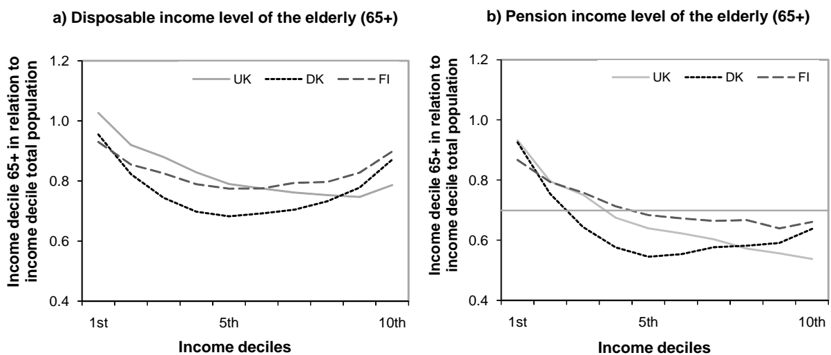
Fig. 3: Income level of the elderly in relation to total population (mid 00s)